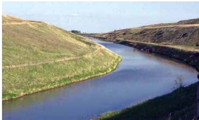
The McClusky Canal.

Garrison Diversion is the state lead in the development of the Red River Valley Water Supply Project (RRVWSP), in which the purpose is to meet the water supply needs